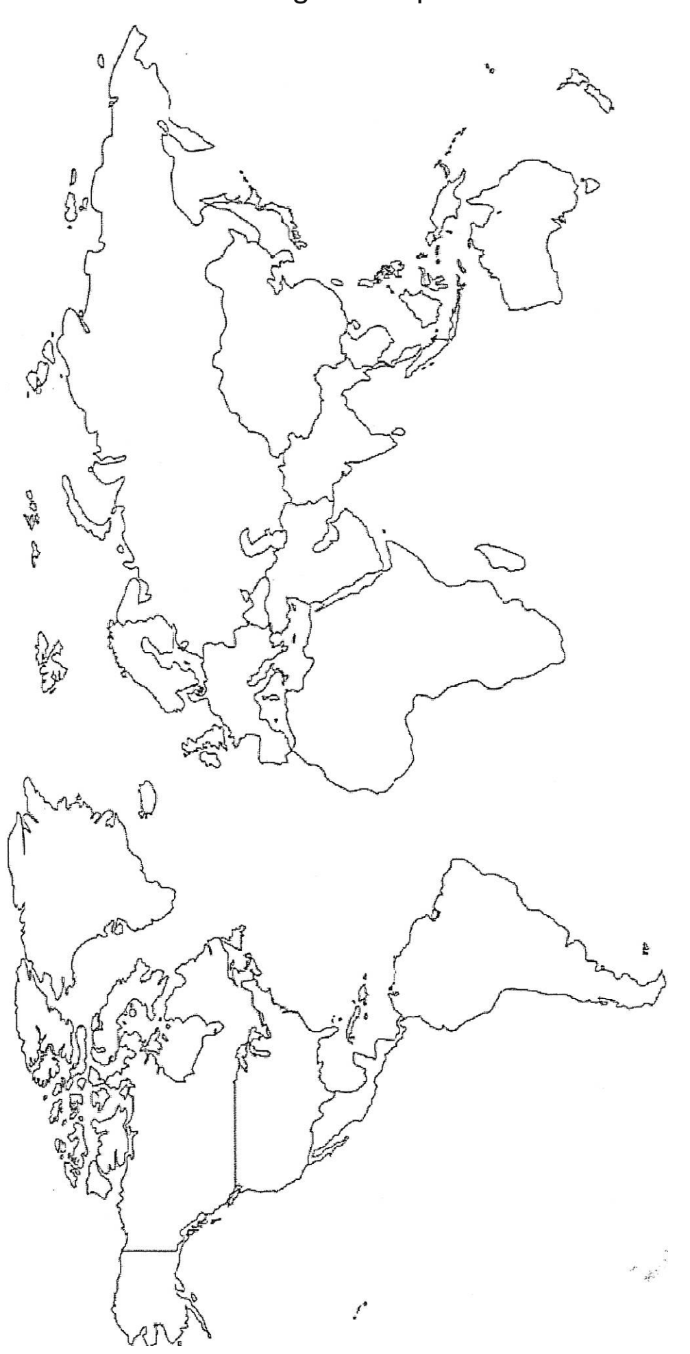
AP Regions Map