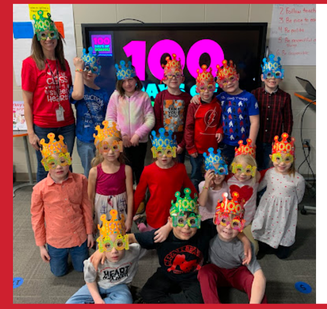
1st graders celebrated Valentine's Day and the 100th Day of School with stations, treats, and a whole lot of fun!